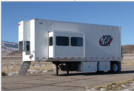
Exterior view of a unit

Our Mobile Sleeper Type 3 provides a proper on-site facility to allow up to 12 employees or guests restful sleep, while giving them the amenities of being at home. The uses for these units are unlimited! We are able to provide significant numbers of Mobile Sleeper units for disaster relief efforts, large events and contracted labor.