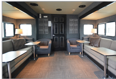
Interior view of the lounge