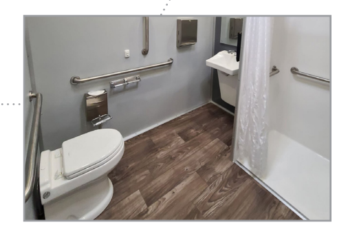
Interior view of the flushable toilet