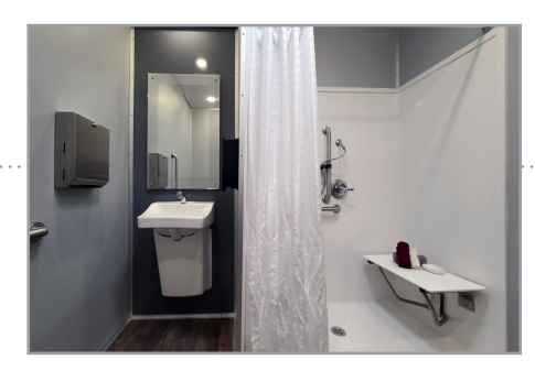
Interior view of sink and shower