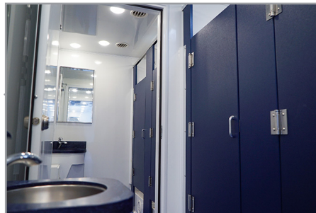
View of the two sink vanity