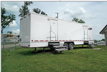
8-Stall Flex Shower Trailer on location

Porta Kleen's 8-Stall Flex Shower Trailer offers the same great features as our regular 8-Stall, but with the option of creating the interior layout that is just right for you. With a straight line layout and two interior doors you have the option to create the perfect space for your project. You can separate the trailer into a 2/6, 4/4, or 8 shower configuration to match your unique requirements.