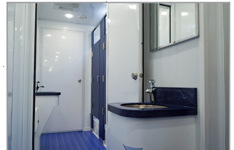
View of the showers